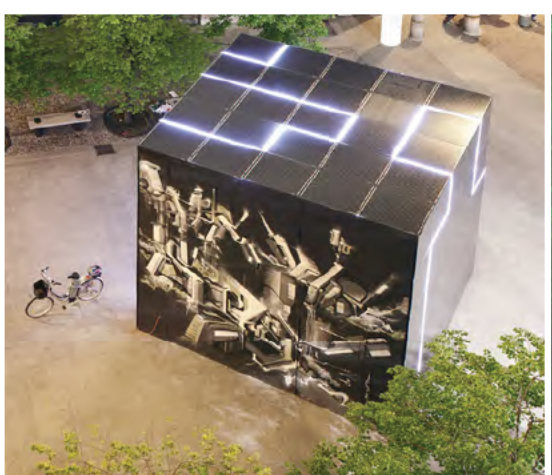
A striking structure creates an iconic entry to the building. The exterior surface of this entry vestibule is comprised of configurable digital walls to mimic the energy consumption, generation, flow, and KPIs of the entire campus in a 3D model , making a strong statement that the Center is not just a building, it is a building with a brain.

Engaging the community is essential to the mission of the Center. The innovations that will originate here are intended to better the world, and that process begins with community participation. Ohio State faculty, staff and students, researchers, entrepreneurs, artists and local industry leaders will make the Center Columbus' new home for public discourse around energy, with public events, TED Talk-style presentations, demonstrations, receptions, and conferences focusing on issues in the energy and digital technology sectors. In cooperation with the local community organizations, the Center will include a dedicated arts program to facilitate artistic design to seep into the innovative products of the designers and developers. The Center will stand apart from other research facilities and innovation centers by offering a public showcase that explores energy issues, active research projects and technology through public events as well as exhibit-style interactive experiences that promote understanding about the state of the industry and the future of innovation.