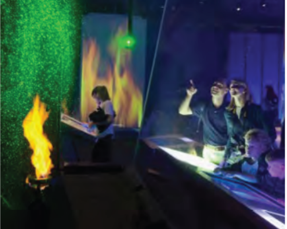
An Interactive Showcase highlights and demonstrates the of state-of-the-art technologies at work and under development in the Center. Through hands-on exhibits, visitors learn about energy and explore curated stories of real innovators and real technology.