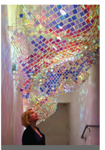
Art installations created by Artists in Residence interpret energy technologies, simultaneously inspiring the viewer, connecting art with science and product development.